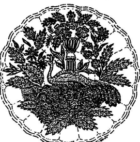
NORTHWOOD PEACOCK & URN 4 TIARA LARGE PATTERN "B"