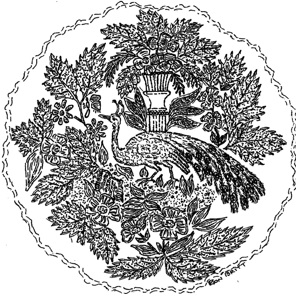
FENTON PEACOCK & URN 2 TIARA LARGE PATTERN