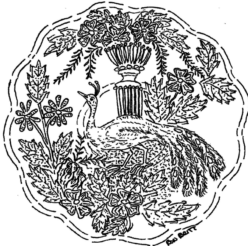
PEACOCK (&URN) VARIANT NORTHWOOD SMALL PATTERN "A"