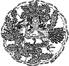
PEACOCK "SHOTGUN" SAUCE MILLERSBURG