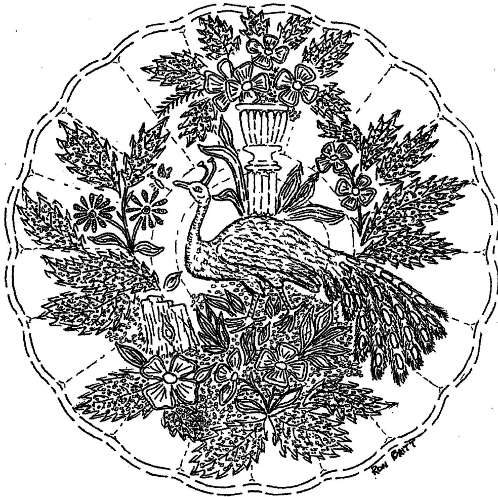
MILLERSBURG "PEACOCK AND URN" LARGE PATTERN