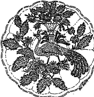
MILLERSBURG "PEACOCK" LARGE PATTERN