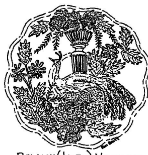
PEACOCK (& URN) VARIANT NORTHWOOD SMALL PATTERN "A"