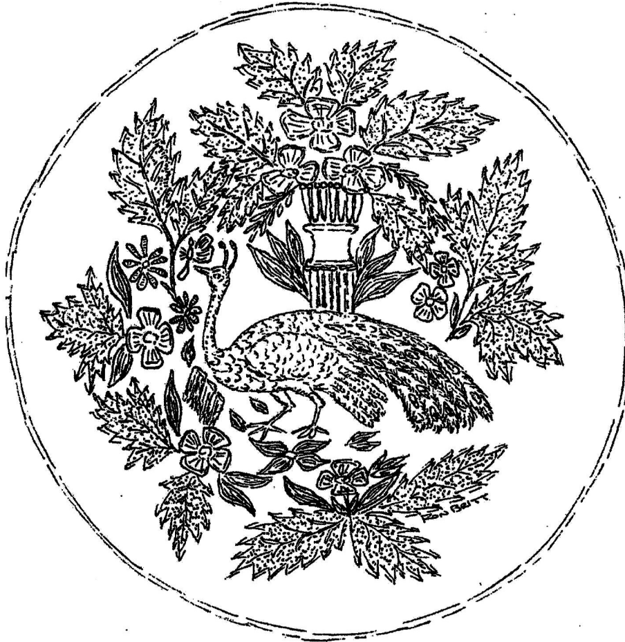
PEACOCK & URN "COMPOTE" FENTON