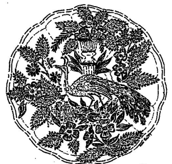
PEACOCK & URN "MYSTERY" MILLERSBURG