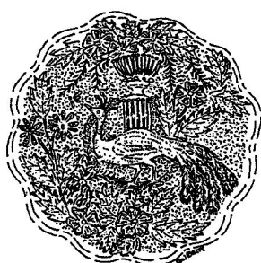
PEACOCK & URN NORTHWOOD SMALL PATTERN "D"