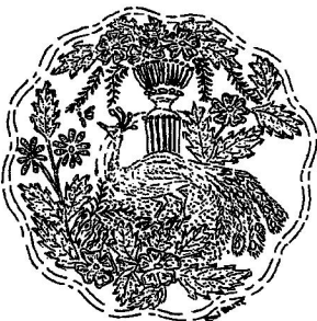
PEACOCK & URN NORTHWOOD SMALL PATTERN "C"