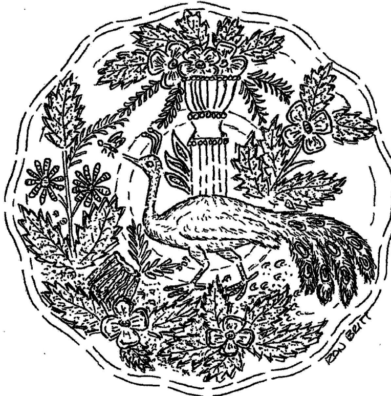
PEACOCK & URN VARIANT MILLERSBURG SMALL PATTERN