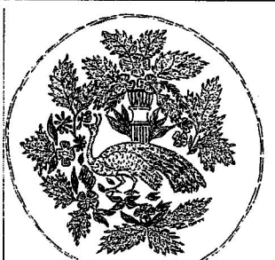
PEACOCK & URN "COMPOSITE" FENTON