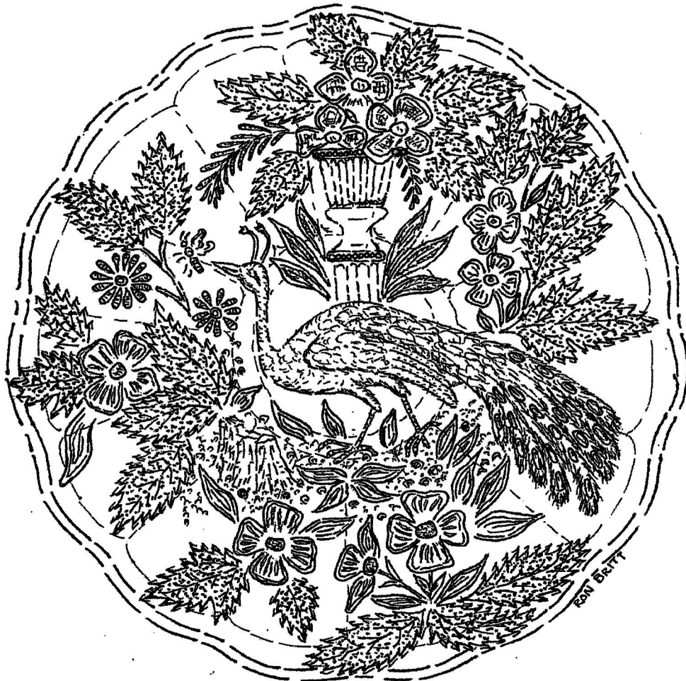
PEACOCK & URN "MYSTERY" MILLERSBURG