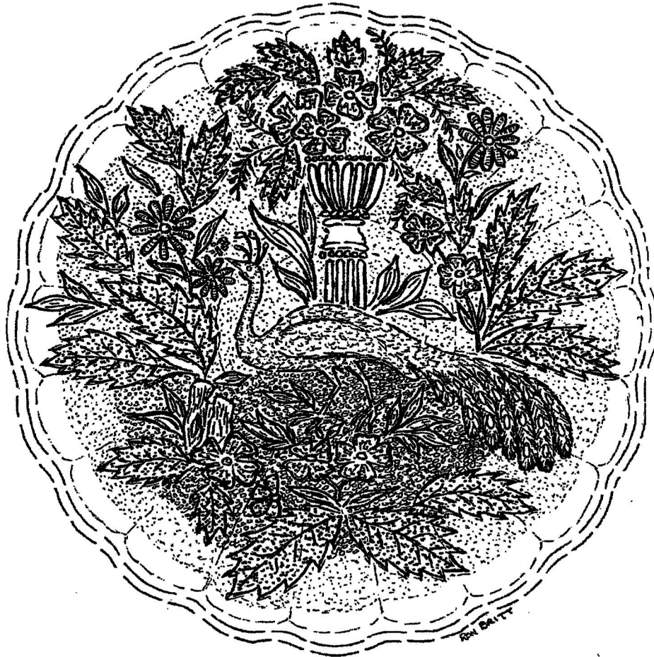
NORTHWOOD PEACOCK & URN "C" 4 TIARA FULL STIPPLE