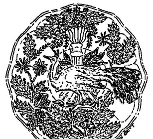
MILLERSBURG "PEACOCK VARIANT" SMALL PATTERN