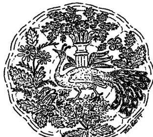
MILLERSBURG "PEACOCK" SMALL PATTERN