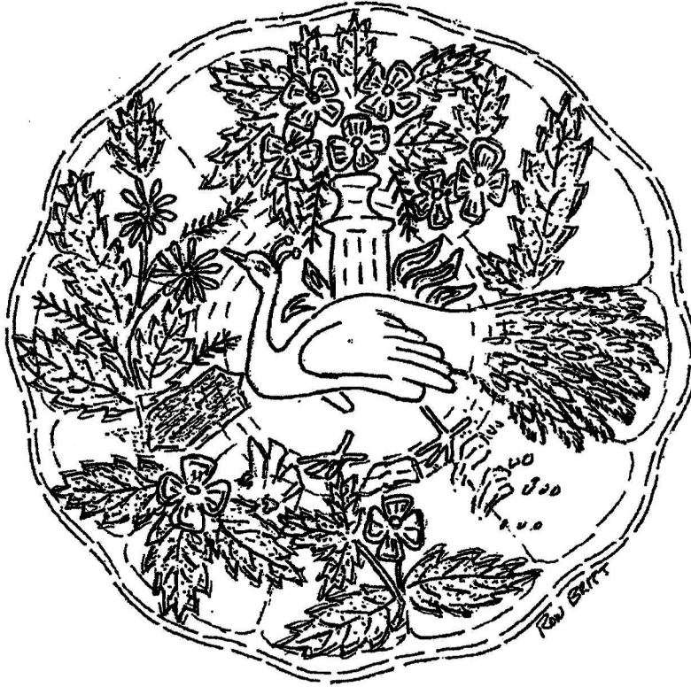
PEACOCK "SHOTGUN WHIMSEY PROOF" MILLERSBURG