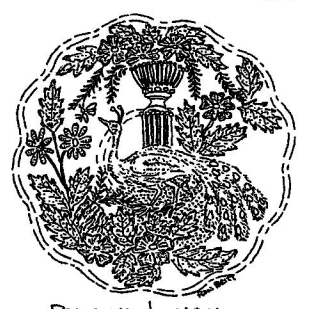
PEACOCK & URN NORTHWOOD SMALL PATTERN "B"