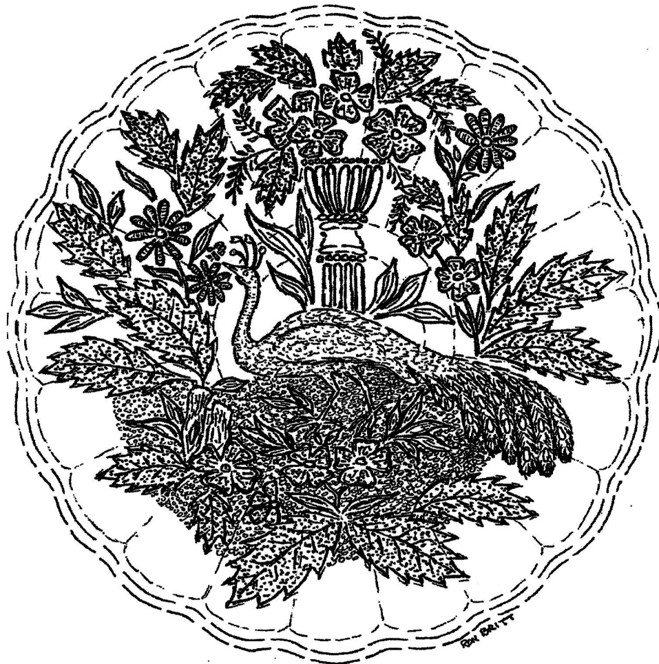
NORTHWOOD PEACOCK & URN "B" 4 TIARA LARGE PATTERN