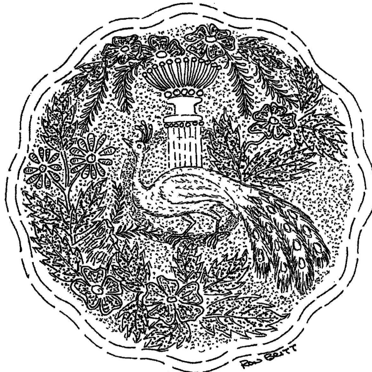
PEACOCK (URN) VARIANT #Z NORTHWOOD SMALL PATTERN "E"