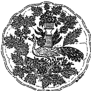
PEACOCK & URN "COMPOSITE" MILLERSBURG