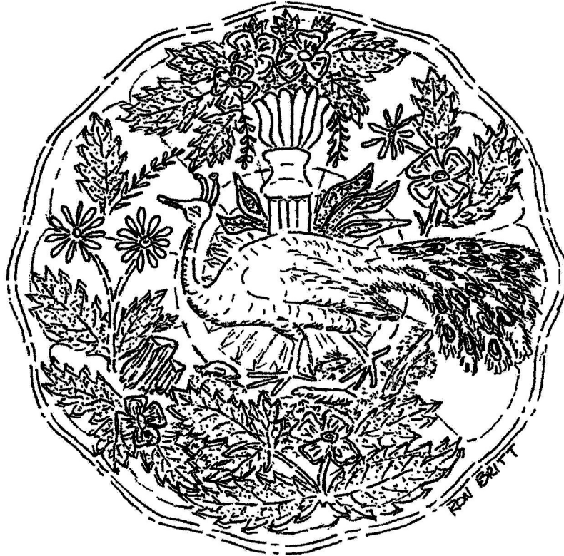
MILLERSBURG "PEACOCK VARIANT" SMALL PATTERN