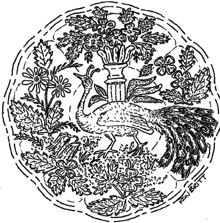
MILLERSBURG "PEACOCK" SMALL PATTERN