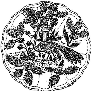
PEACOCK & URN "SHOTGUN" MILLERSBURG