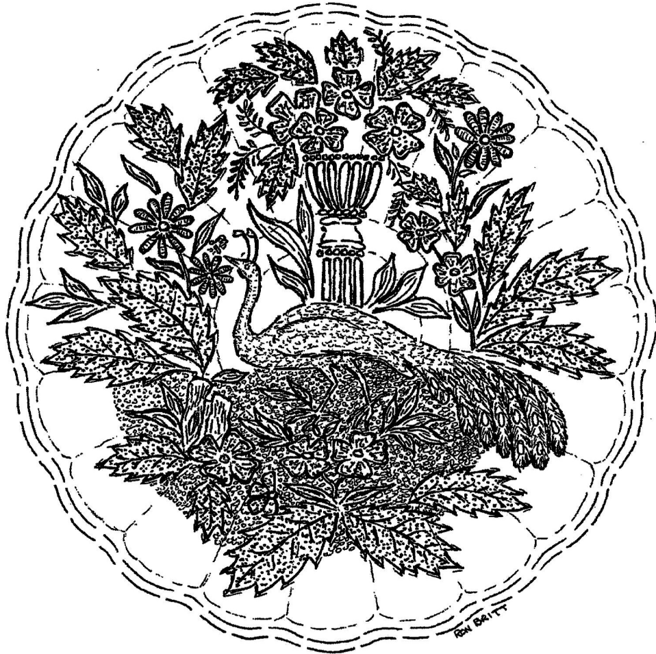
NORTHWOOD PEACOCK & URN 2 TIARA LARGE PATTERN "A"