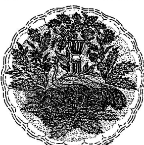
NORTHWOOD PEACOCK & URN 4 TIARA FULL STIPPLE "C"