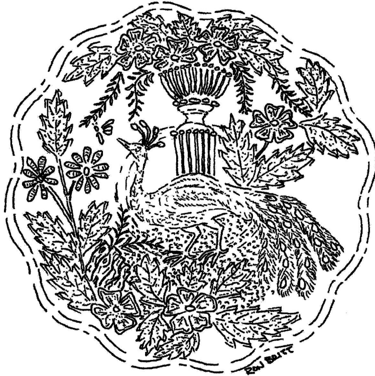
PEACOCK & URN NORTHWOOD SMALL PATTERN "C"