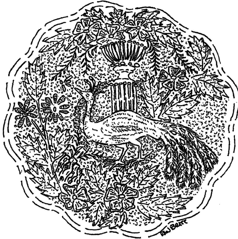
PEACOCK & URN NORTHWOOD SMALL PATTERN "D"