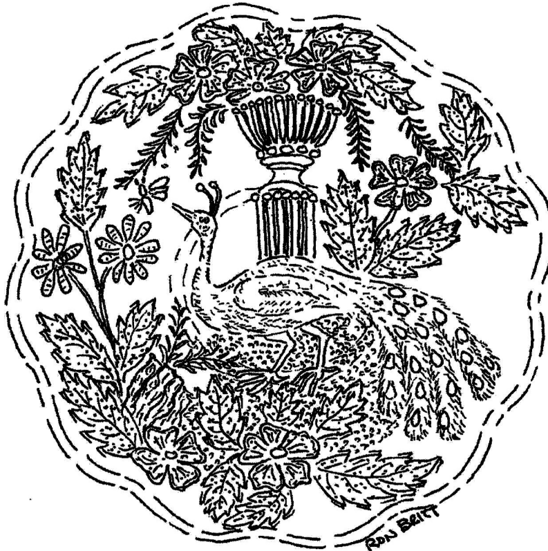
PEACOCK & URN NORTHWOOD SMALL PATTERN "B"