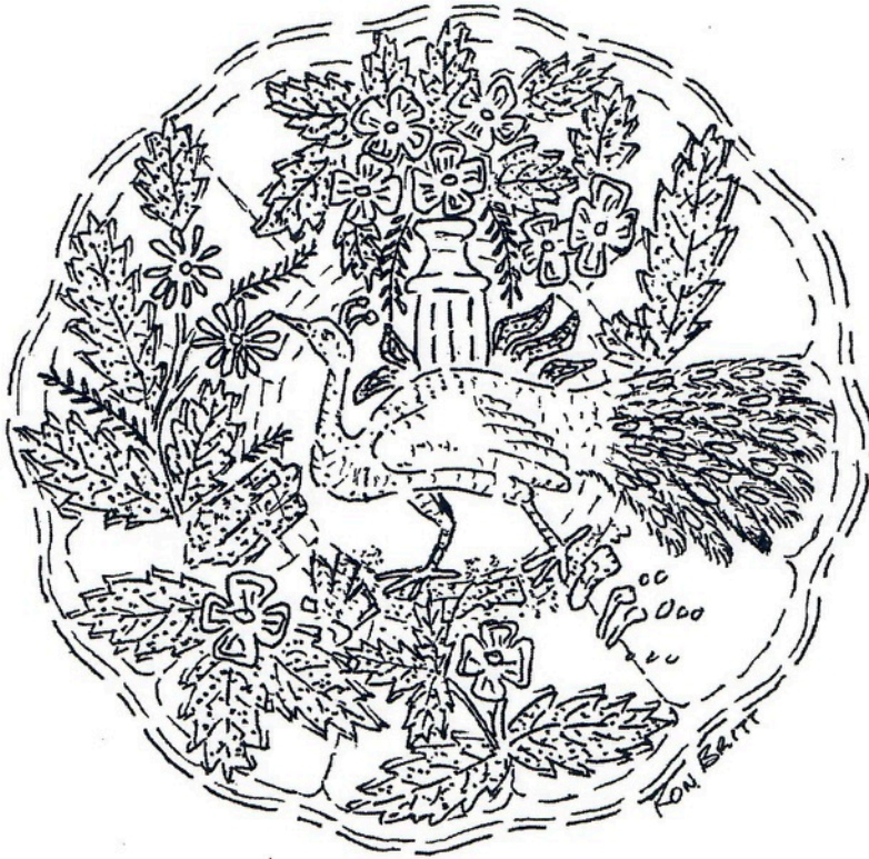
PEACOCK "SHOTGUN" SAUCE MILLERSBURG