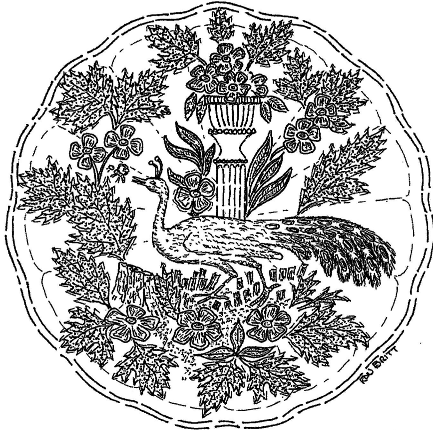
PEACOCK & URN "COMPOTE" MILLERSBURG