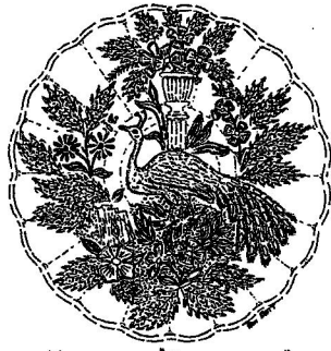
MILLERSBURG "PEACOCK AND URN" LARGE PATTERN