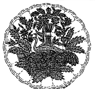
NORTHWOOD PEACOCK & URN Z TIARA LARGE PATTERN "A"