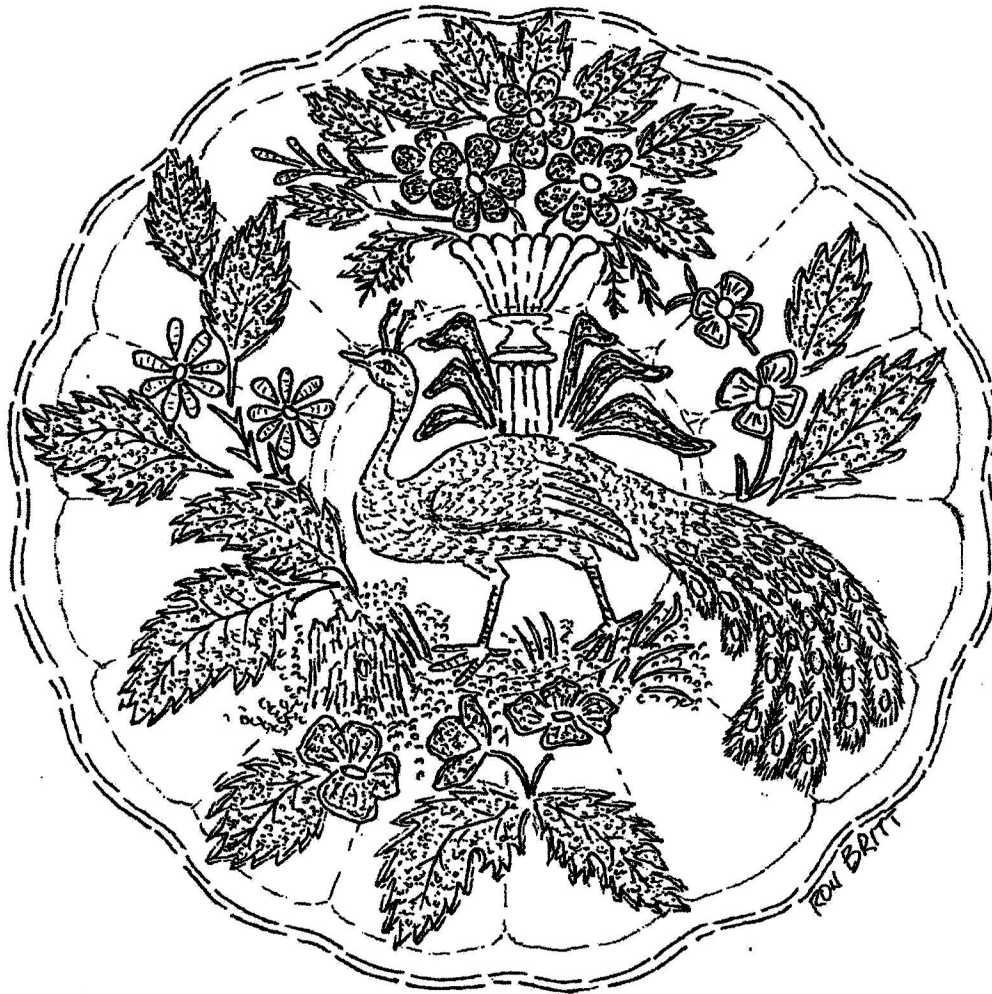
MILLERSBURG "PEACOCK" LARGE PATTERN