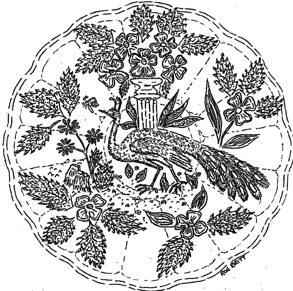
PEACOCK & URN "SHOTGUN" MILLERSBURG