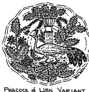
PEACOCK & URN VARIANT MILLERSBURG SMALL PATTERN