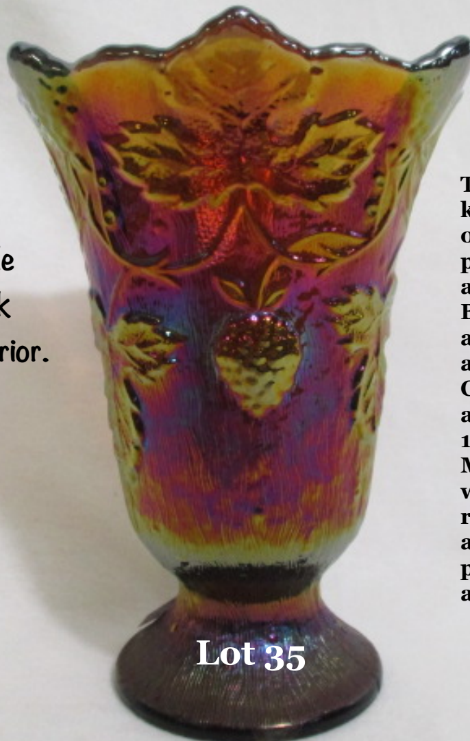
Millersburg purple Blackberry Bark vase with Rays interior.

* Preview Friday 5:00 pm to 9:00 pm and doors open at 8:00AM Saturday.