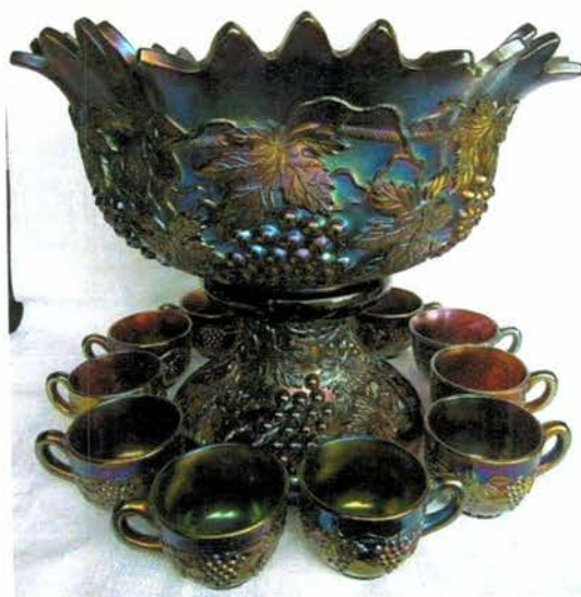
LOT # 201