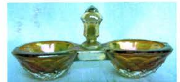
LOT # 42