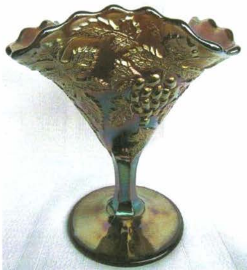
LOT # 95