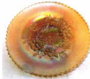
LOT # 181