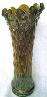
LOT # 43