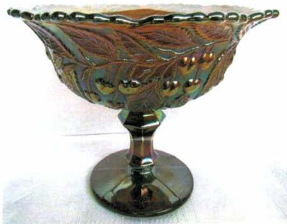
LOT # 91