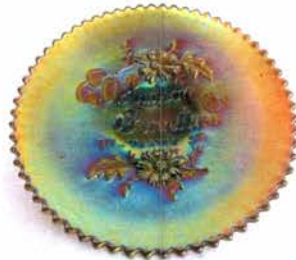
LOT # 180