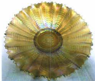
LOT # 150