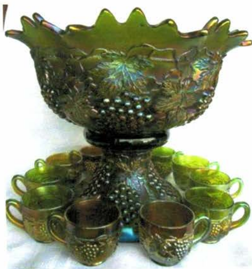
LOT # 200

For more information or to leave mail bids, call Tom Burns at 407-592-6552