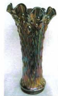
LOT # 44