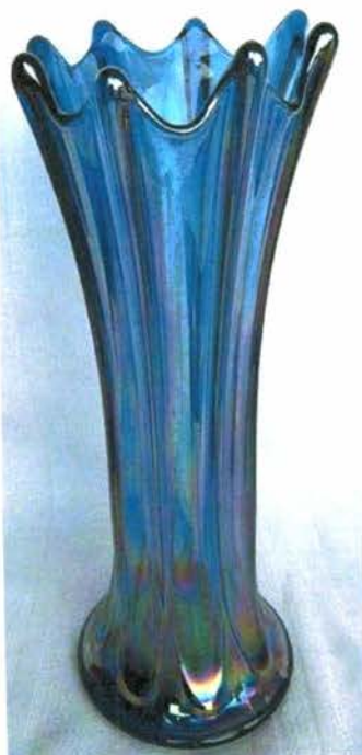
LOT # 350