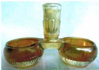
LOT # 41