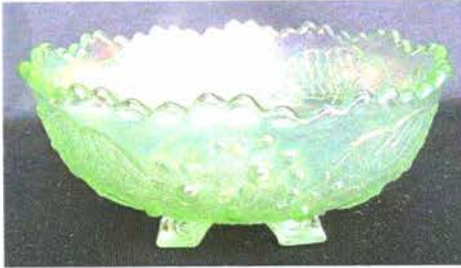
LOT # 290

Visit www.necga.com for pictures and brochure, Click on carnival glass links page, Look for Burns Auction. AUCTION FLEX AVAILABLE FOR THIS AUCTION . CHECK US OUT ON AUCTION ZIP #29661.