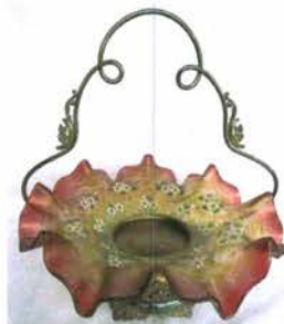
LOT # 130