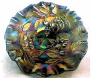
LOT # 90