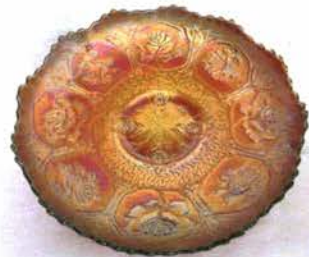
LOT # 275