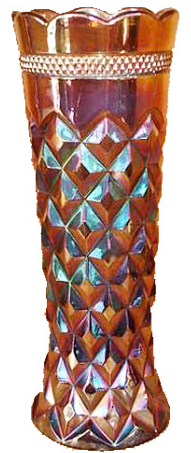
VA 260 Blue Riihimaki /ase