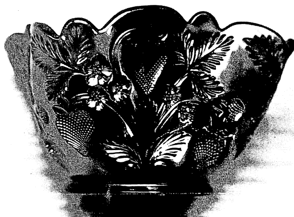
Side of Lot #10

We are pleased to present to you a fine selection of glass to be sold in conjunction with the Mid Atlantic Jamboree. The glass has been accumulated by dealer / collectors from the east and should provide an attraction for all.