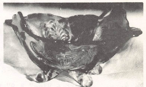
Butterfly & Tulip Marigold 9" Footed Bowl