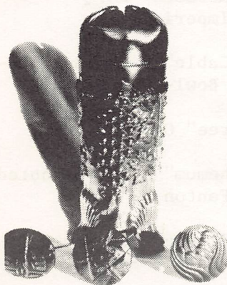
Northwood Purple Grape & Cable Hat Pin Holder & (3) Hat Pins