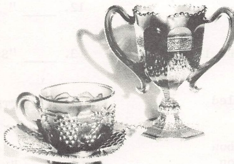
"Orange Tree" Blue Loving Cup "Grape & Cable" Purple Northwood Cup & Saucer