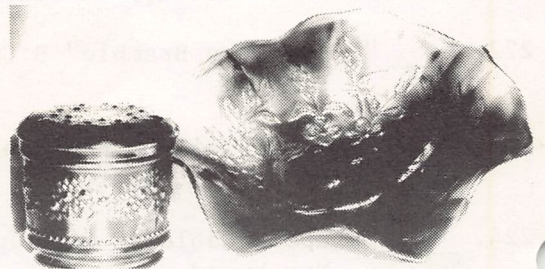
Miller'sburg Green 9" Trout & Fly Bowl Orange Tree Blue Powder Jar