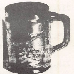
Fisherman's Mug - Purple