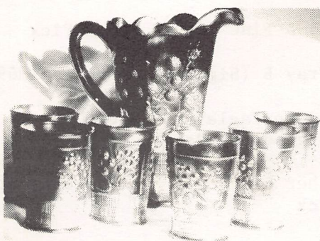
7 Pc. Northwood Raspberry Water Set