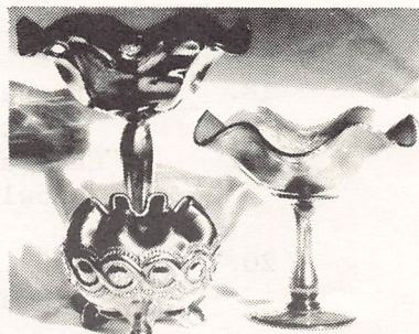
Northwood Beaded Cable Blue Rose Bowl & (2) Compotes