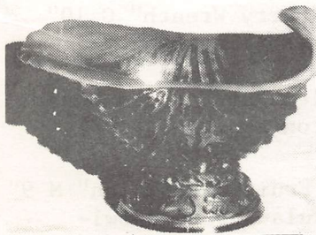
Peach Opalescent Nautilus Signed Northwood

A VERY RARE MILLERSBURG AMETHYST FLOWING VINE COMPOTE, MARIGOLD 1910 DETROIT ELKS B.P.O.E. BOWL, 2 PCS. RED, & MUCH MORE.