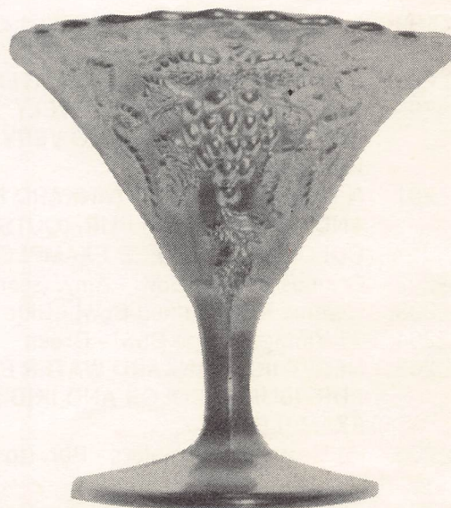
LOT NO. 225