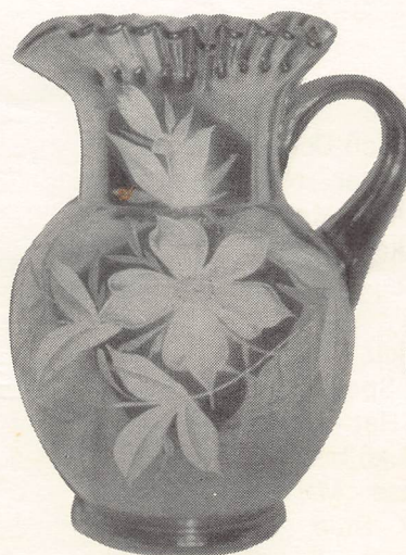
LOT NO. 140