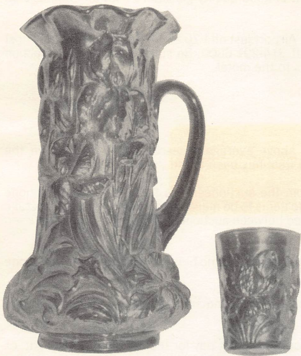
LOT NO. 205